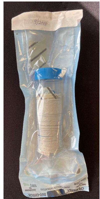
Bulk tank sample collection device